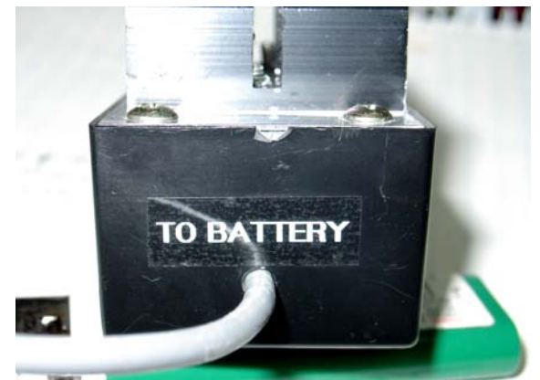
Output to battery