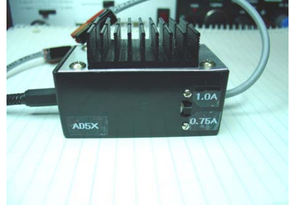
Side view, showing charge switch