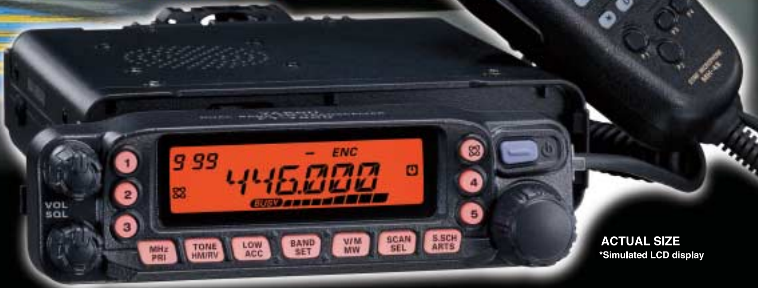
ACTUAL SIZE *Simulated LCD display